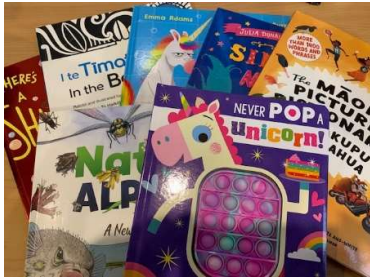
Our latest new books

The 4 th issue is now available online. Thanks to those that purchase books through Scholastic as we receive a credit for every book purchased that we put towards our book purchases.